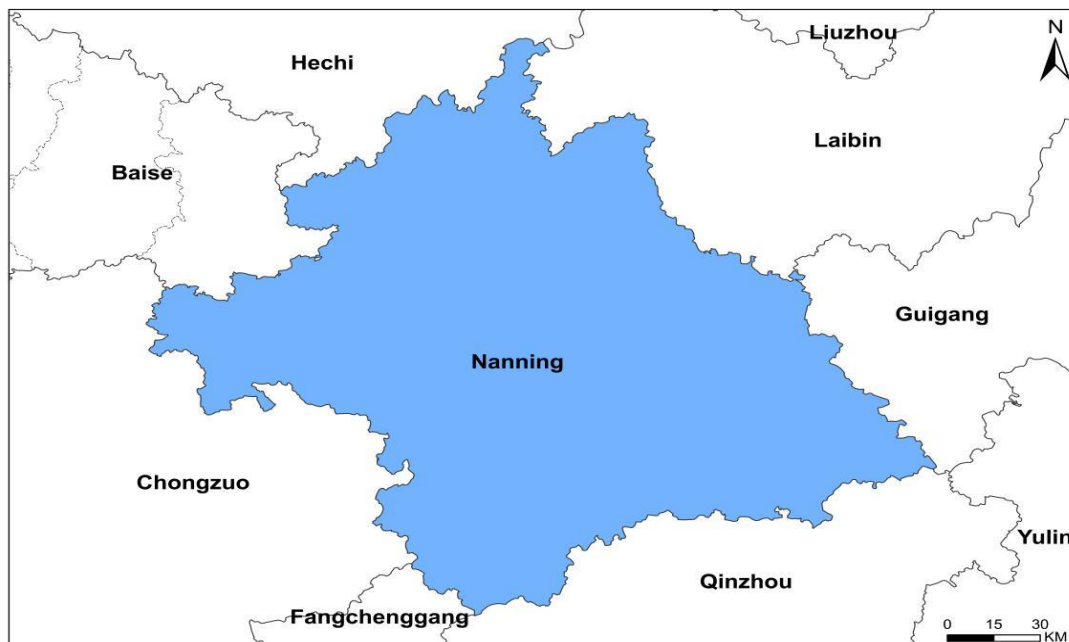
Figure 1: Research Site - Nanning City, Location of the Guangxi Zhuang Opera Troupe

1) Nanning: The Guangxi Zhuang Opera Troupe is situated in the capital of Guangxi Province.