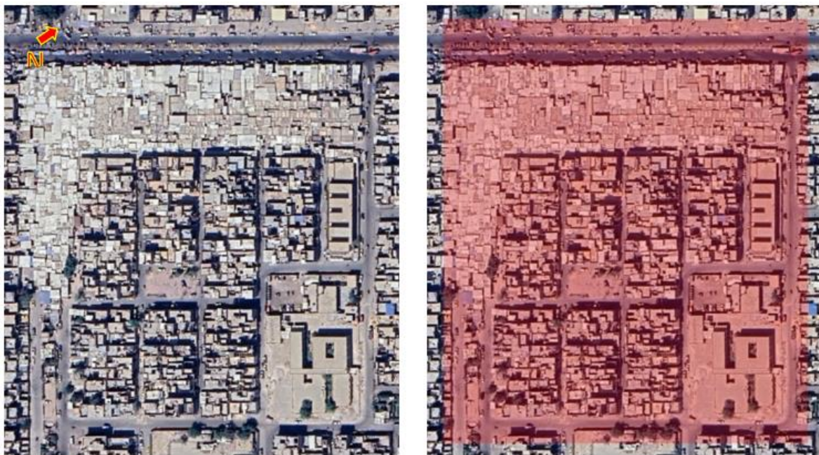
Figure 3: Aerial view of the study sample from Sadr City.