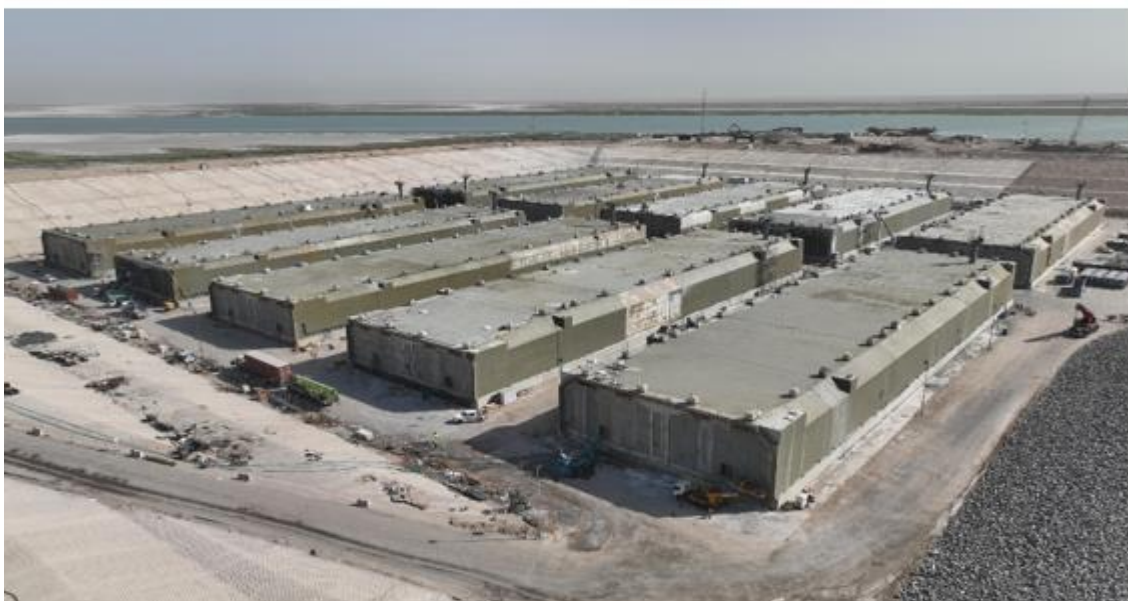
Figure 3: 10 Pieces of the Immersed Tunnel at the Work Site and Pouring Before Transporting Them.

The immersed tunnel is one of the most important projects of the Grand Faw Port. Its first phase was completed in 2022, by completing the manufacturing basin project for the basic parts that make up the tunnel, with an area of (95200 m) and a depth of (16.2 m). As for the current second phase, it was started in August 2021, by Daewoo Engineering and Construction Company and under the supervision of the Italian company Techntal with the General Company for Iraqi Ports. The construction of the immersed road tunnel began with the approach ramps and connection to the road linking the Grand Faw Port and Umm Qasr with a length of 24 meters, and a width of three lanes in each direction. The second phase included the construction of the immersed tunnel pieces and the approaches, which number ten pieces with a length of 126 meters, and a width of (346) meters, while the number of approaches that make up the entrances and exits of the tunnel is (56) pieces on both sides, the first side from the side of Umm Qasr city, and the other side from the side of Faw city, and the length of The piece is (21) meters long and (346) meters wide, and by connecting it, the immersed tunnel will be formed with a length of 2444 meters.