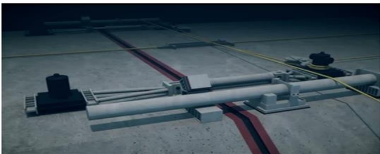
Figure 5: Pictures showing the method of installing the immersed tunnel pieces together in a tight hydraulic way in Jeddah without any problems or water leakage.