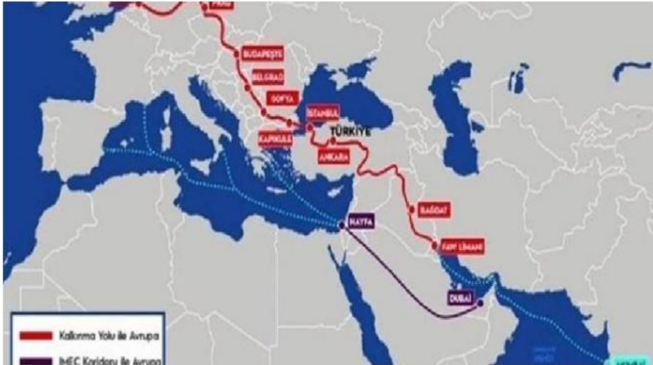
Figure 6: Development path with Iraq.

Turkey, Qatar and the UAE, and aims to establish a strategic trade route linking the city of Basra to the Turkish border via a 1,200-kilometer railway. The project aims to achieve integration in the supply and transportation chain, and is considered geopolitically an alternative to the traditional trade route through the Bab al-Mandab Strait and the Suez Canal, which will provide a more efficient and less costly route. Economically, the project enhances the welfare levels in the region by providing new job opportunities and revitalizing sectors such as construction, health and tourism, while its success requires the provision of sustainable security, as the stability of the region is essential for the success of the project and ensuring the achievement of its development goals (Zaman, 2024).