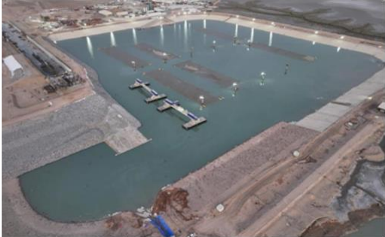
Figure 4: Submerging 10 immersed tunnel segments to apply Archimedes' principle in lifting the tunnel segments and preparing them for transport to the required location by sea.

Air intake and lifting of the pieces the process of gradually introducing air into the tanks begins, which increases the buoyancy of the pieces. The process is carefully monitored to ensure that the pieces are stable and free from any damage. Lifts and support equipment are used to control the buoyancy process and ensure that the pieces are lifted safely.