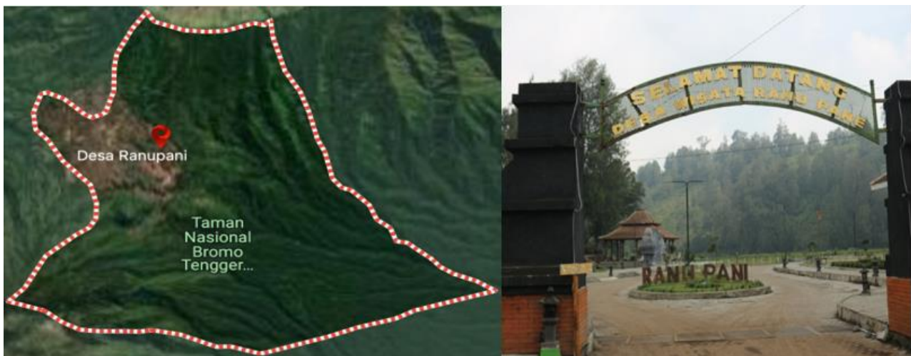
Figure 1: Location of the Study Area.

The research location was conducted in Ranupani Village, Senduro District, Lumajang Regency, East Java Province, Indonesia, with a population of 1,477 people covering an area of approximately 3,578.75 Ha consisting of 318.40 Ha of land owned by residents and 3,260.35 Ha of forest area of Bromo Tengger Semeru National Park (TNBTS) with a conservation function. Ranupani Village has the potential for sustainable tourism development; as a village that is the gateway to the TNBTS Area, it has unique natural beauty and local culture. This potential can be maximized through the involvement of local communities in participatory tourism management.