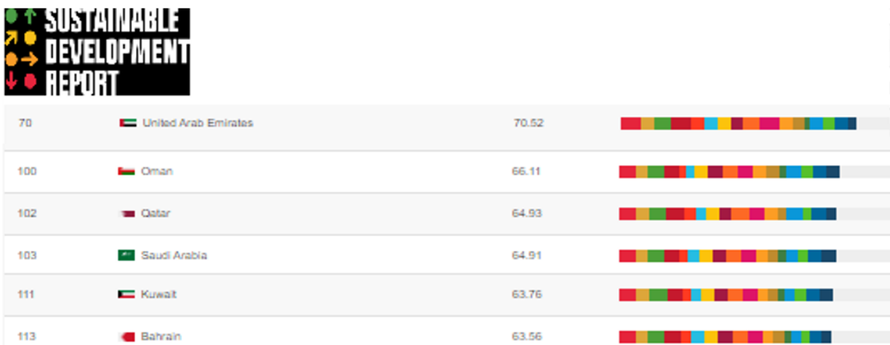
Figure 2: the GCC score of SDG index in 2024.

The GCC countries adopted the United Nations goals for sustainable development, and included them in their future visions, national plans, and governmental programs. Its executive bodies were assigned to it, and even established ministries specialized in it, followed up on the implementation of these goals, and provided regarding the implementation of its national voluntary reports, and even created measurement indicators, and was keen on international interaction, regarding obstacles to implementation. The performance of the GCC countries in the SDGs can be observed from the SDG index and the dashboard shows the scores as shown in the figure 2. The higher level is UAE as they come in the 70 position out of 193 countries and scoring 70.5 out of 100.