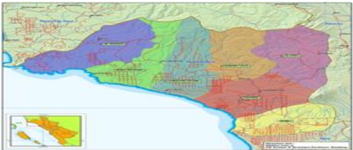
Figure 1: Study Area of West Pasaman Regency, West Sumatra Province, Indonesia.

Geographically, West Pasaman Regency is located between 00° 33' North Latitude and 00° 11' South Latitude and 99° 10' to 100° 04' East Longitude. West Pasaman is one of the districts in the Province of West Sumatra, Indonesia. This area was formed from the division of the Pasaman Regency based on Law Number 38 of 2003 concerning the Establishment of Dharmasraya, South Solok, and West Pasaman Regencies dated December 18, 2003, with the capital city of Simpang Ampek district. The regional map of West Pasaman Regency, West Sumatra Province, is shown in Figure 1.