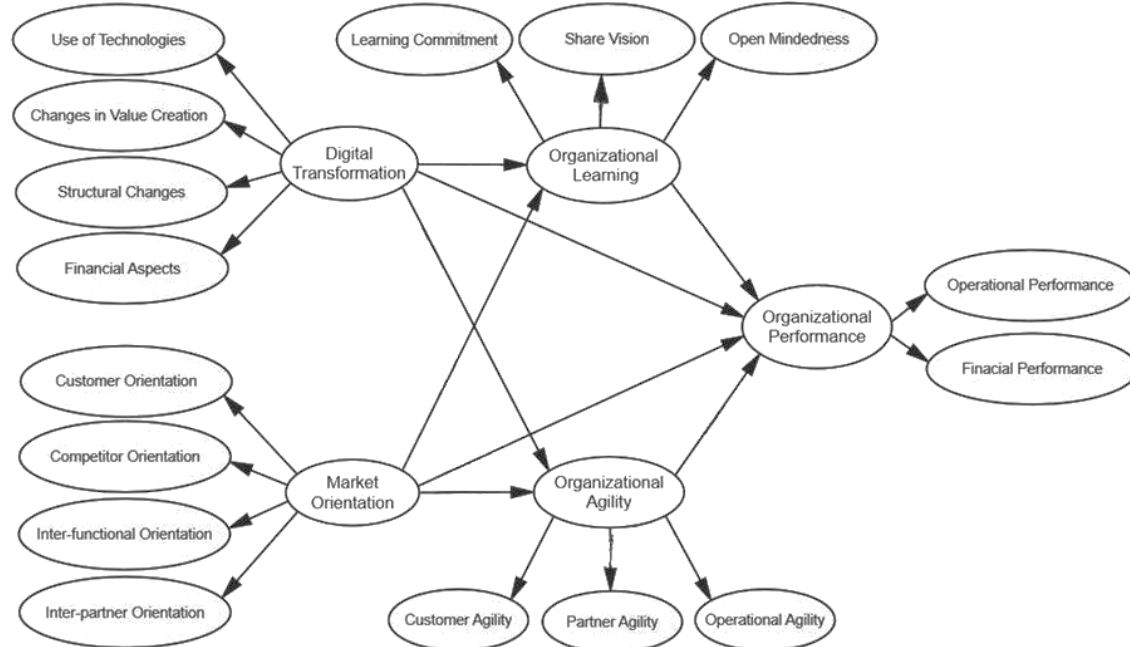
Figure 1: Conceptual Framework.

H 12 : Organizational agility mediates the relationship between market orientation and organizational performance.