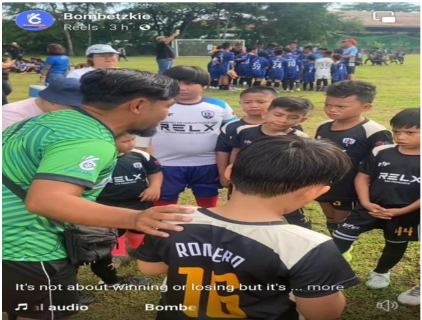
Figure 2: Coaching and developing children using football.

We utilized rigorous selection criteria to carefully select the respondent for the study, focusing on involvement in coaching grassroots football and numerous accomplishments. Professionals in the field meticulously designed and semi-structured the interview guide questions, then thoroughly evaluated them. We provided the coach with the interview guide question and a request for consent. Additionally, we informed the coach about the research goal and sought his support and agreement on it. We conducted the observation and interview using an internet platform, and the coach also recorded the data to ensure its clarity. The respondent's involvement in community assignments and coaching grassroots programs prolonged the interview. Witnessing the respondent's coaching technique also enriched the interview. The next section examines eight aspects of the interview's findings, as revealed by the grassroots football coach in Butuan City. Contextual information, methodology, and beliefs help maintain a harmonious equilibrium between the technical and tactical aspects. Obstacles encountered in community-level football: Strategies for overcoming challenges include striving for achievement or success, collaborating with other coaches, and improving the capacity to create the holistic well-being of the child.