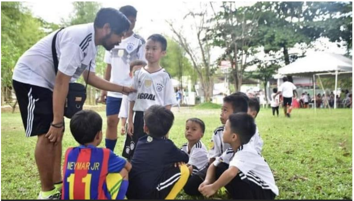
Figure 1: Coaching and developing children using football.

Through these collective efforts, the once-muted voices of grassroots football in the Philippines are now resonating loudly, painting a vision of a future where the whole child – their physical, cognitive, social-emotional, and character development – is nurtured through the transformative power of the beautiful game (Cutcher, & Boyd, 2018; Baquiran, 2014).